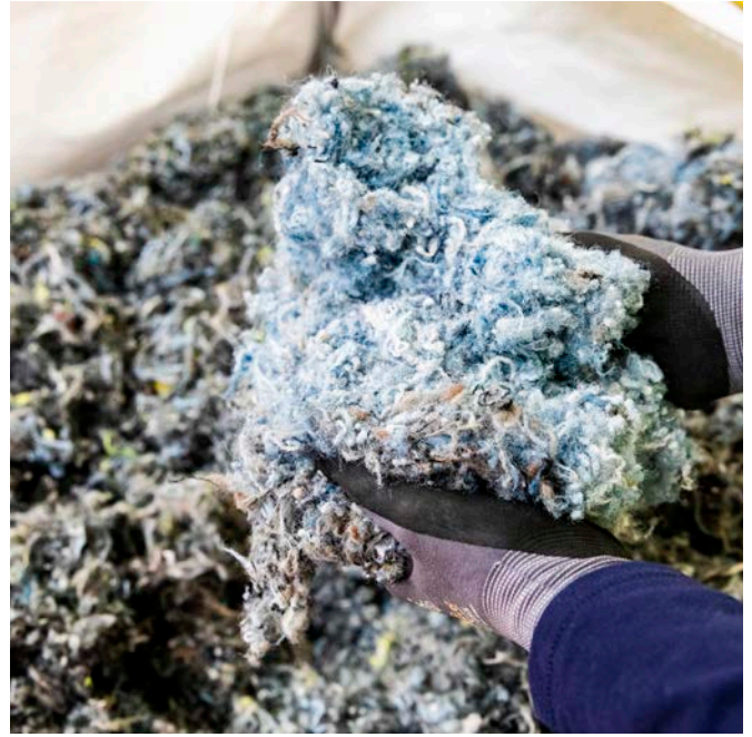
Fluff - high purity yarn (95%) - is generated by Tarkett's recycling center, before it is sent to Aquafil