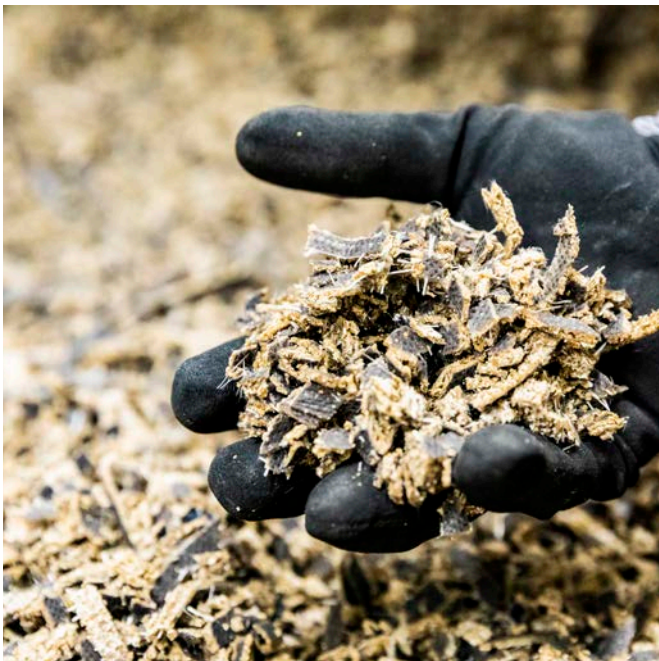
Shredded EcoBase backing separated from the carpet tile and recycled for the production of new EcoBase