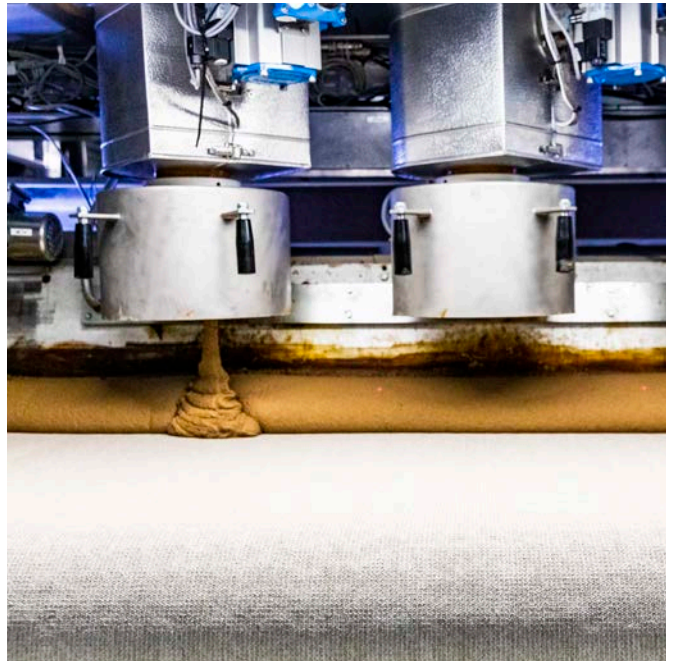
New EcoBase backing production line

Tarkett has invested approximately 15 million euros on this whole set of initiatives aimed at closing the loop on carpet tiles in Europe.