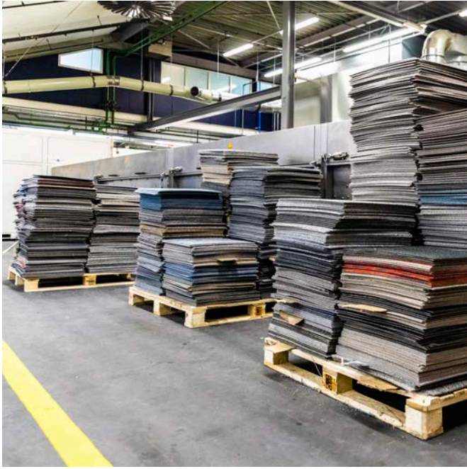
Post-consumer carpet tiles collected through Tarkett's ReStart program