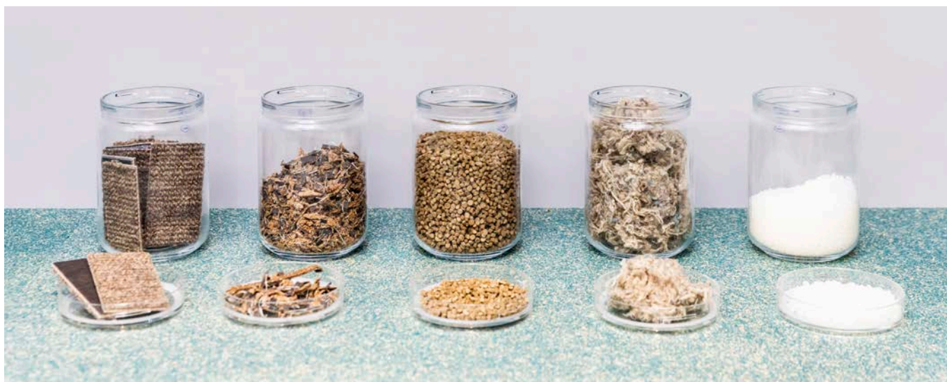
Carpet tile materials at different stages of the separation and recycling process

Paris, France and Waalwijk, The Netherlands, November 21, 2019 –